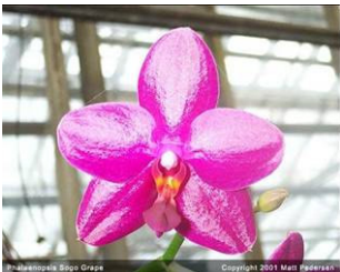
Phalaenopsis Sogo Grape