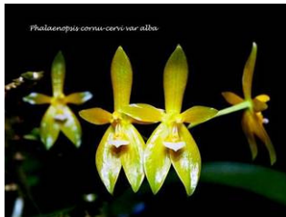
Phalaenopsis cornu-cervi var. alba

(Photograph of Phalaenopsis cornu-cervi courtesy of Jay Pfahl's web site Orchid Species Photo Encyclopedia at: www.orchidspecies.com ; all other photographs courtesy of Matt Pedersen at: www.cichildrecipe.com/orchids/index.asp . Also check out Matt's web address at: SlipperOrchid.com )