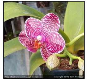
Phalaenopsis (Brother Fancy x Joey) 'Tainan'