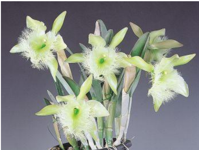
Rhyncholaelia Digbyana Yoko HCC/AOS