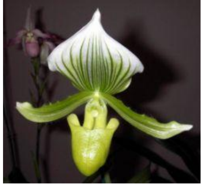
Paph. Maudiae coloratum and Paph. Maudiae Magnificum More fun with Paphs and another reason they are so interesting.