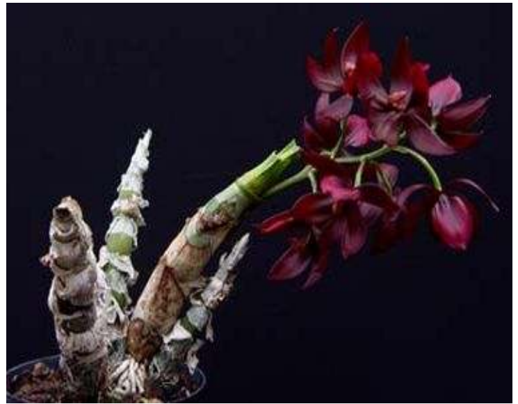
Cynodes Wine Delight 'Jem' FCC/AOS