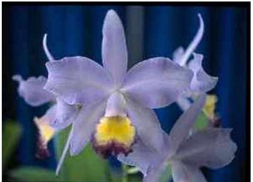
C Granier's Charm 'Blue King' AM/AOS

He will be bringing plants for sale so bring your wallets and your appetite for new plants.