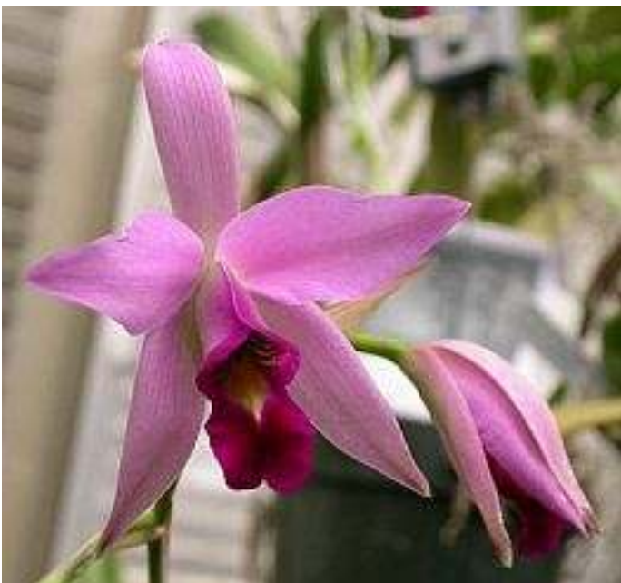
Laelia anceps 'Boulder Valley' HCC/AOS

As always, we encourage you to bring your blooming plants to the show table and share your skills and the beauty of your plants with your fellow members. We will continue to need a little assistance from the membership to facilitate the show table results and the contest tally. Would you please print your name and the name of the plant clearly? It is really hard if someone has to guess at the name of the plant or of the exhibitor. It makes life a little easier if you include all of the info in an easily readable form. Thanks.