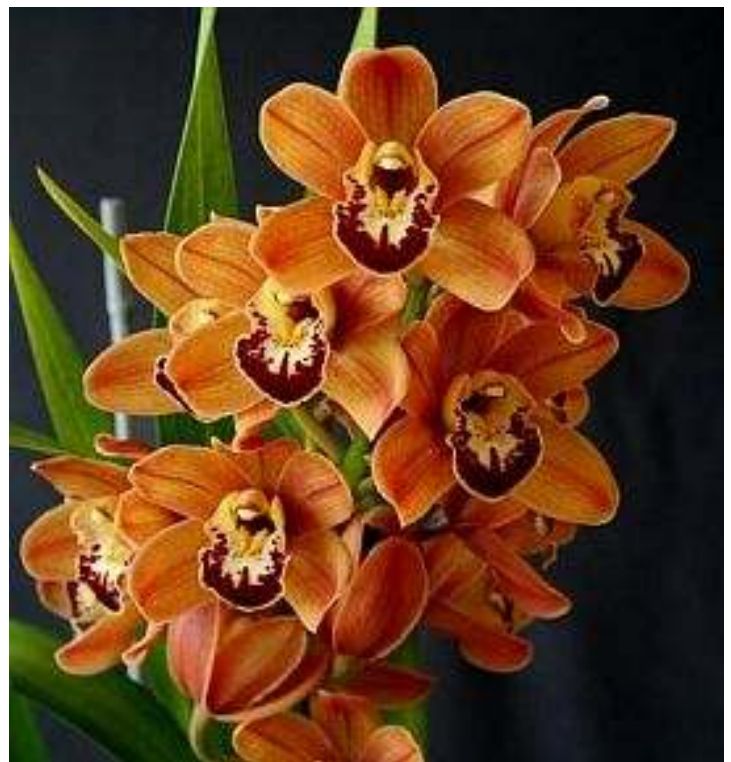
Cymbidium William Weaver