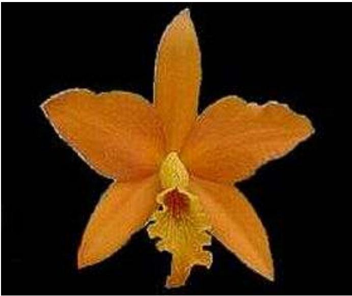
Blc Volcano Prince