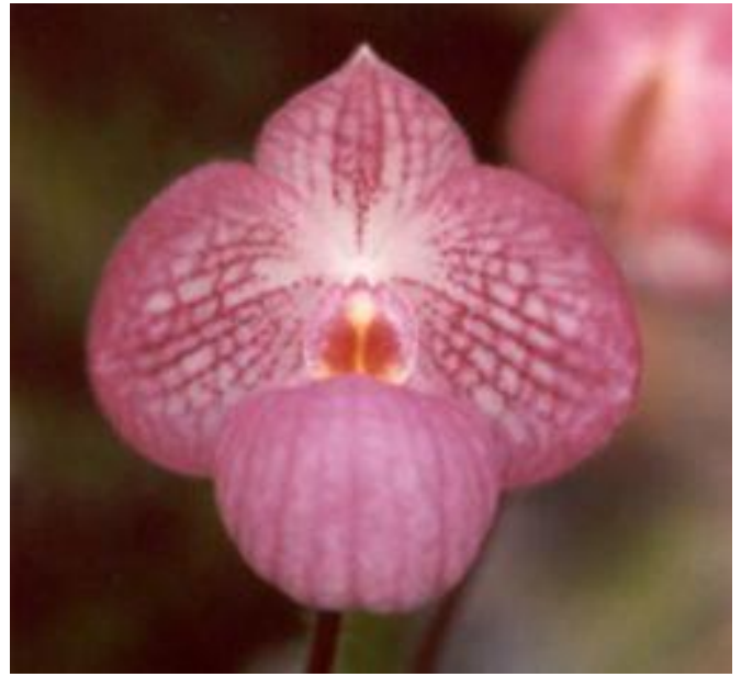
Paph. Magic Lantern