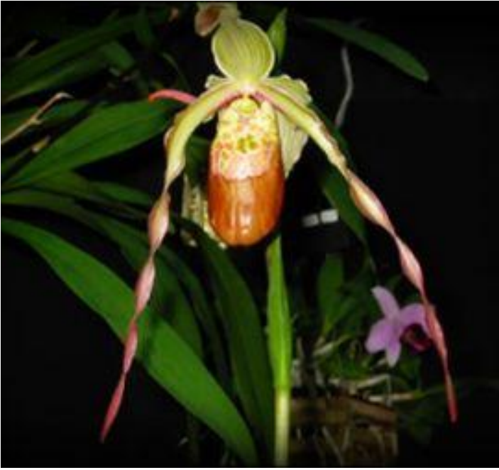
Phragmipedium Les Dirouilles