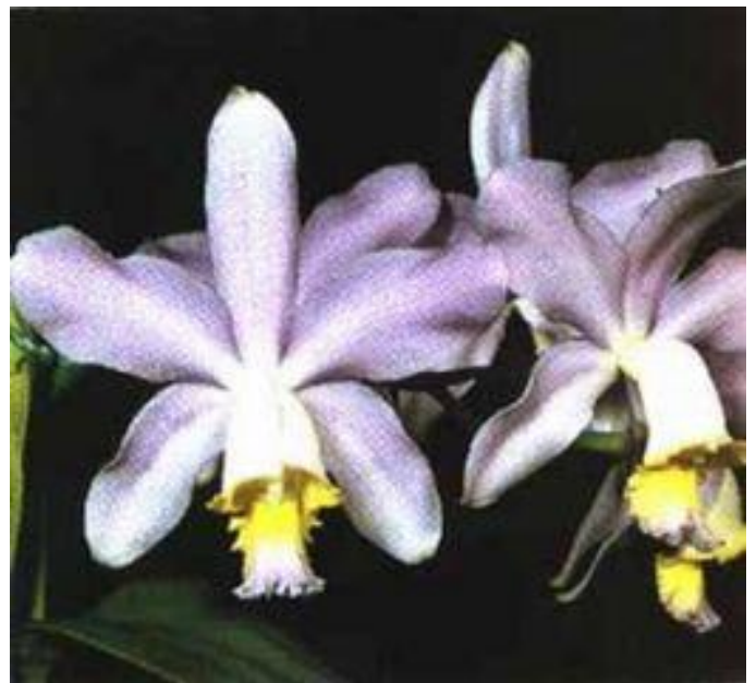
Cattleya lodegessii coerulea 'Blue Sky'