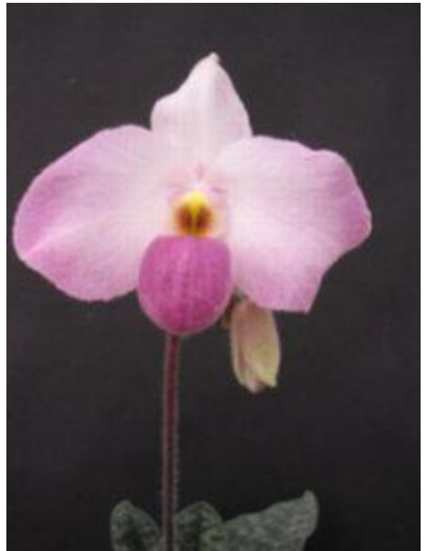
Paph. Ho Chi Minh

As is our usual custom we'll be having a pre-meeting meet-and-greet dinner with our speaker at 6PM, this month at Aladdin's on East Main Street, just east of the conservatory. All members are welcome!