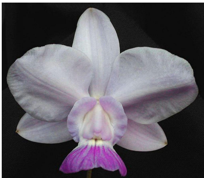
Cattleya walkeriana delicatata