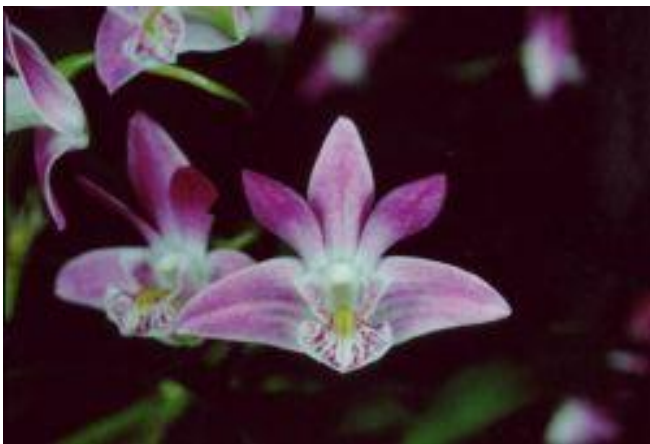
Dendrobium kingianum Trident's Pinky AM/AOS