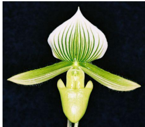
Paphiopedilum lawrencianum hyeanum