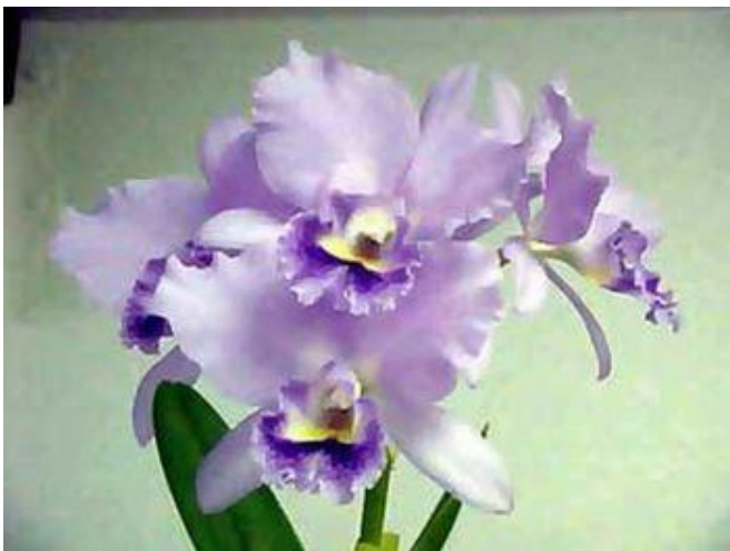
Blc. Lois McNeil 'Ace'

Genera Plants will be growing quickly now and really enjoying the hot humid days so similar to their native habitat. Watch for pests though, as many of these also enjoy the same conditions as the plants. Check flower spikes so that they can extend unimpeded for the best flower presentation later.