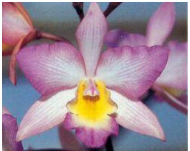
Iwanagaara 'Apple Blossom'