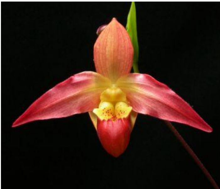
Phrag Twilight x China Dragon

January 9 July 10 March 13 September 18 May 8 November 13