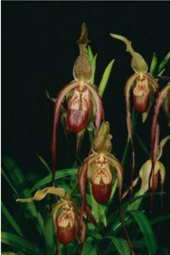
Phrag Grande 'Crystal'