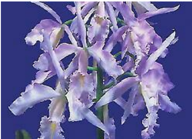
C. maxima coerulea