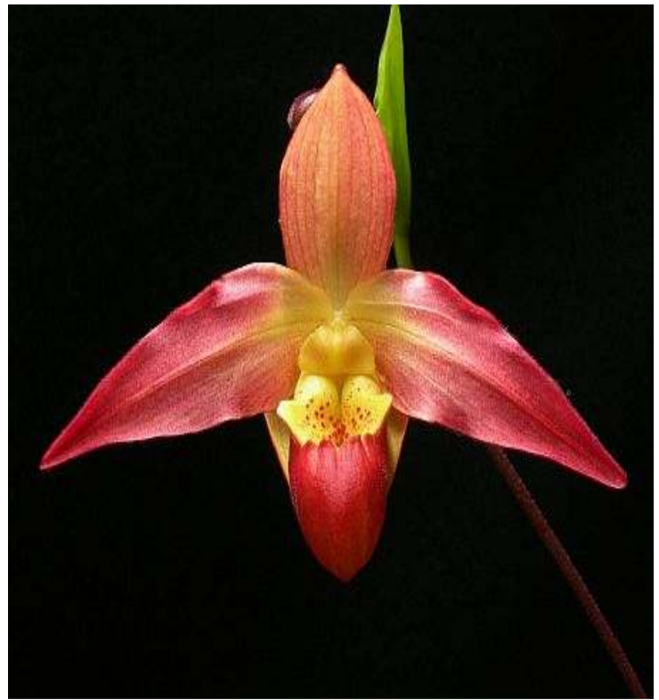
Phrag Dragon's Light