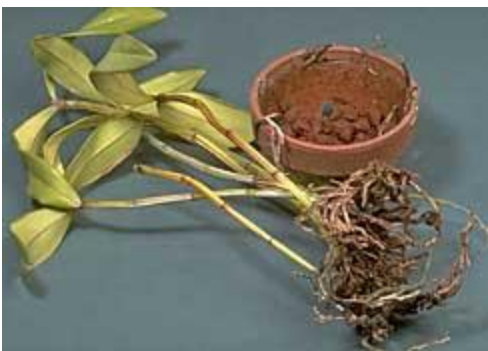
A desiccated Cattleya note lack of live roots.

Orchids in dry summer areas dry out much more rapidly than they did in the winter. Depending on temperature, plants watered every two weeks in the winter may need to be watered every few days in the summer. Here again, nothing will take the place of careful observation. If you have an extensive collection of plants, you might want to consider installing a misting system similar to those used in open-air restaurants in dry areas. Low pressure units that install on hose lines are inexpensive and work reasonably well to raise humidity as well as cool the growing area somewhat.