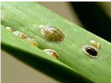
Soft brown scale

Summer presents challenges in the form of increased pest activity, fungal and bacterial problems in traditionally wet areas and desiccation in those areas with Mediterranean-like climates where summers are typically quite dry. Observation is the watchword for the summer months. Careful observation of your plants is the best way to identify small problems before they become big problems and in the summer, the time between these two events is dramatically shorter due to higher temperatures --- the earlier you catch a problem, the easier it is to control.