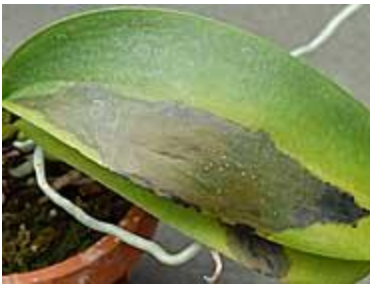
Bacterial rot on Phalaenopsis leaf.

In areas with dry summers, mites can be a serious problem especially on phalaenopsis. These creatures attack the surface of the leaves producing a sort of rough, silvery appearance. Mites are not insects and insecticides offer little or no control. Mites do not like humid conditions so efforts to increase humidity are beneficial. Light infestations can be controlled by thoroughly cleaning plants but in hot, dry climates light infestations rapidly become serious and control is best accomplished by the use of a miticide.