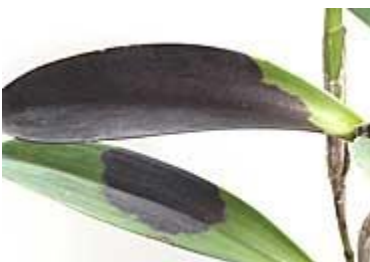
Black rot, a fungal disease on Cattleya leaves.

Wet foliage and high humidity encourages the spread of fungal and bacterial diseases. Bacterial diseases do not respond to fungicides and vice versa so it's very important to know which disease you are dealing with. Perhaps the easiest way to distinguish between the two is by smell. The most common bacterial disease in orchids produces a foul smell often likened to dead fish. If you've ever had cut flowers stand too long in water you know the sort of smell we're talking about.