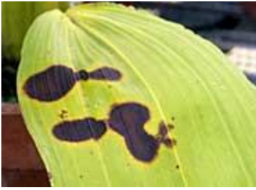
Sunburn on a Bifrenaria leaf.

summer. Sunburn, while not in itself a serious problem is irreversible and will make your plants look ugly. In serious cases the plant can be killed outright and any leaf damage is an invitation to a secondary infection in the damaged area.