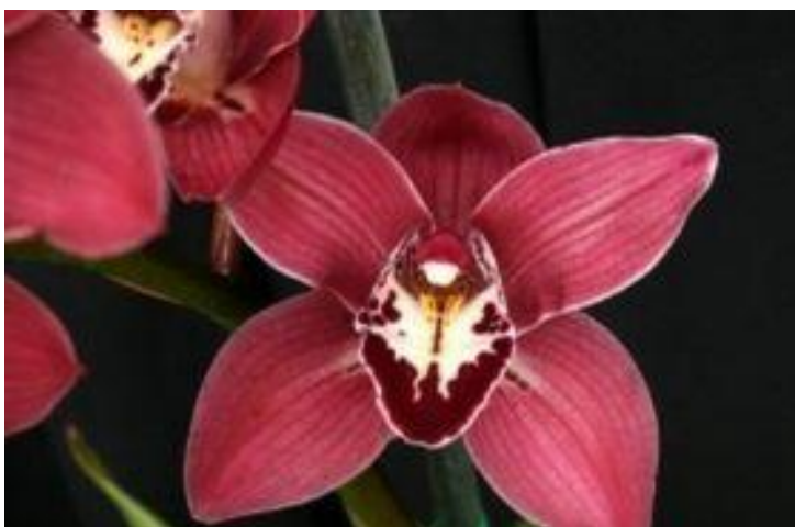
Cymbidium Claude Pepper 'Purple Splendor'