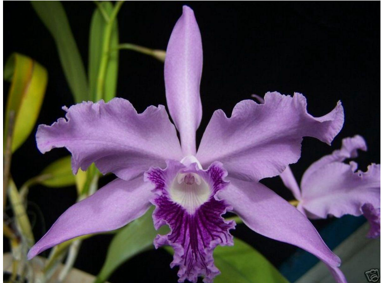
Laelia lobata v. coerulea

One thing that's fun to do with a handful of money is buy an armload of seedlings ... they're inexpensive so you can get a relatively large number of them and you can try your hand at growing a variety of orchids. But the downside is that many orchids take years and years to reach blooming size. You may easily invest four or five years or more nurturing a seedling to maturity before being gratified or disappointed by its first bloom. Nothing inherently wrong in that. Repeat the spending spree every year and you'll eventually enjoy a continuing profusion of first blooms every year. Some better than others. Some more reliable than others.