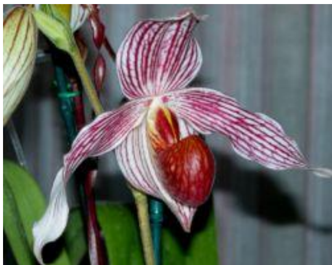
Paph Gerd Rollke