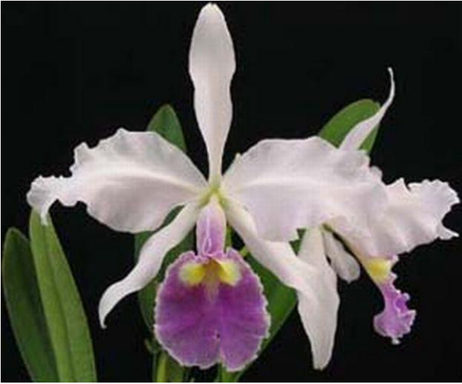
Cattleya warscewiczii coerulea