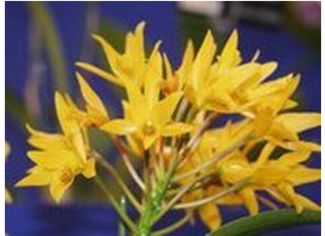
Cattleya aurantiaca no, no it's Guarianthe aurantiaca var aurea No, no, it's Epicladium ...that's it...that's the ticket... Epicladium aurantiaca ...or is it...