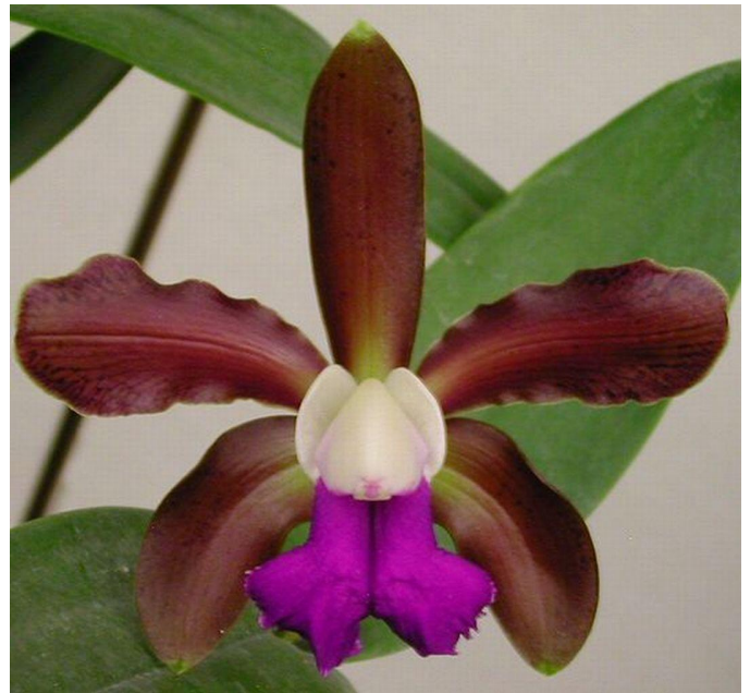
Cattleya Furrow's Brown Baby