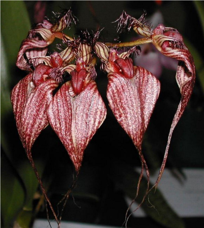
Bulbophyllum Red Chimney