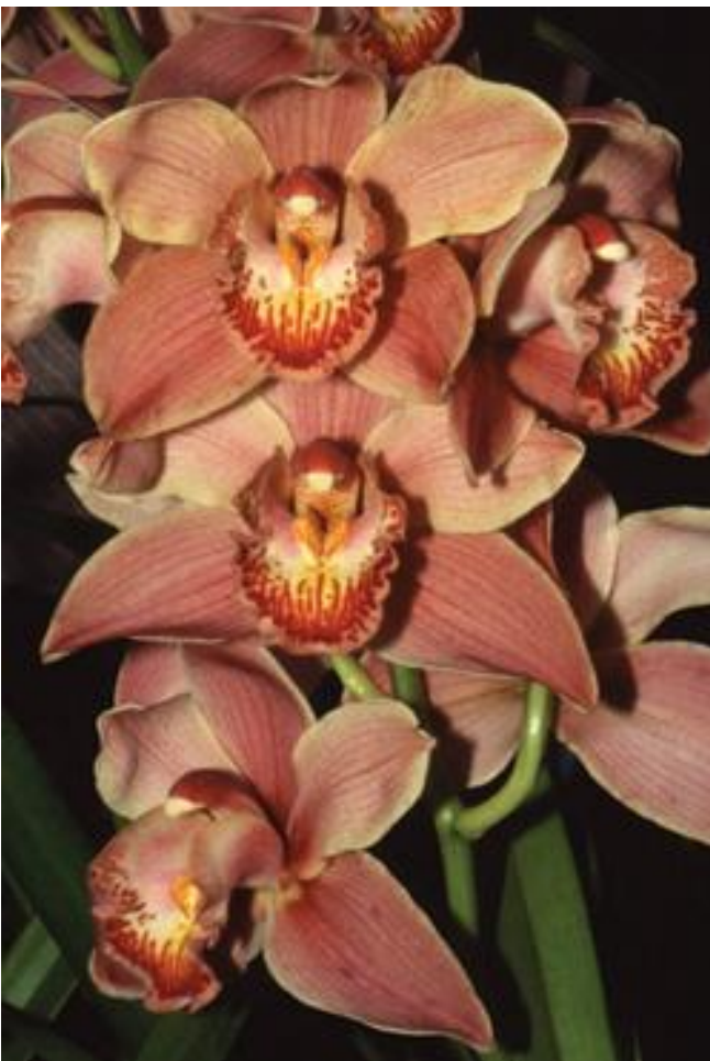
Cymbidium Dream Valley