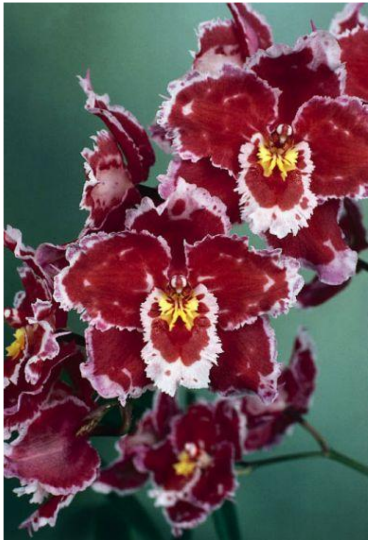
Odontioda Mount Bingham