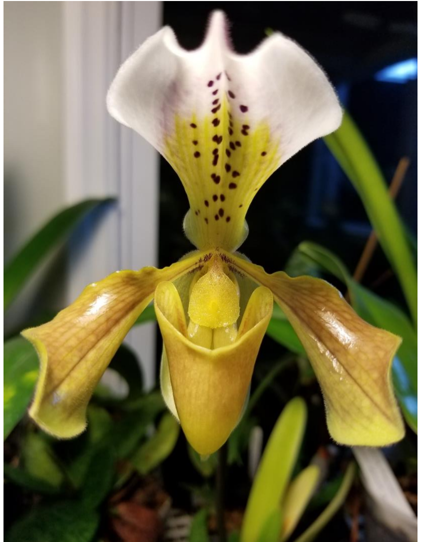
Figure 1: Paph gratrixianum

I will keep it brief this month—we had a great year as a society, full of fellowship, sharing, and learning! We always want feedback on what we can do better to make YOUR society more rewarding, so please feel free to reach out to me or any of our board members with your ideas. Hope to see you all at our November pot luck and looking forward to another great year in 2019!