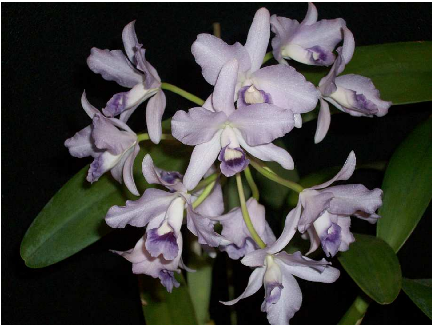
C. bowringiana v. coerulea 'Blue Smoke' HCC/AOS Grown by B. Cavanaugh